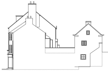
02 EXISTING ELEVATION SOUTHEAST SIDE