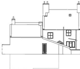
04 EXISTING ELEVATION NORTHEAST REAR