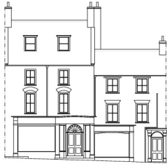
01 EXISTING ELEVATION SOUTHWEST FRONT