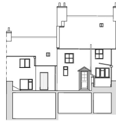
03 EXISTING ELEVATION NORTHEAST REAR OF FRONT BLOCK